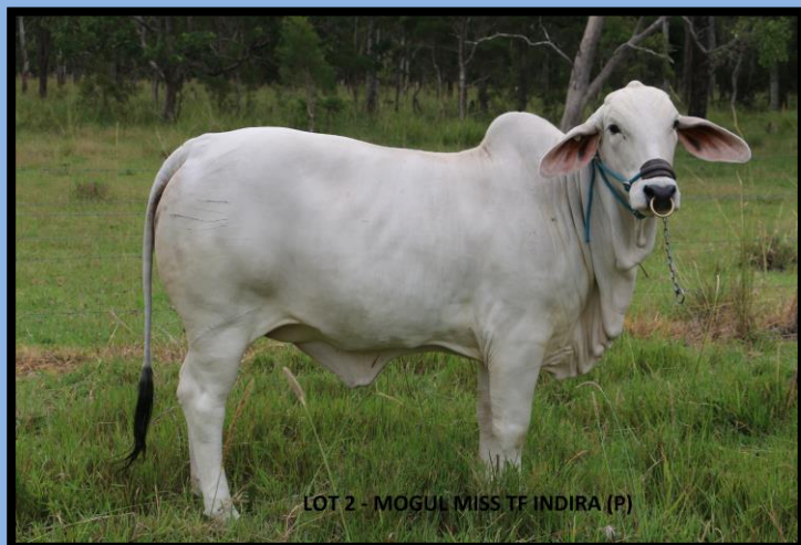
LOT 2 - MOGUL MISS TF INDIRA (P)

Located in the Northern Rivers region of NSW: 200 Fardons Lane Yorklea via Casino NSW 2470